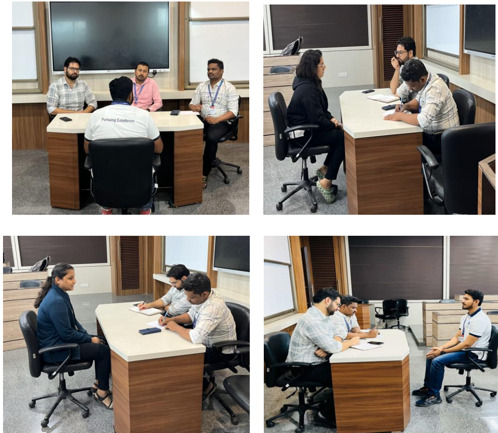
Interview held for vice-presidential candidates